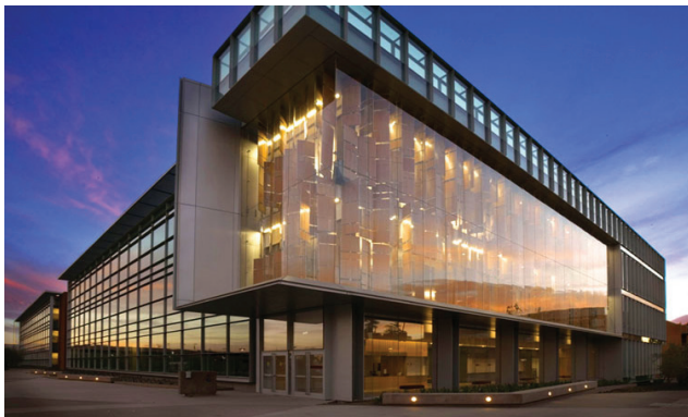
Biodesign Institute at ASU

At a cost of nearly $150,000,000, the 350,000 square foot, award-winning Biodesign Institute at ASU represents the State of Arizona's largest research infrastructure investment in bioscience-related research. ASU is the first university in the