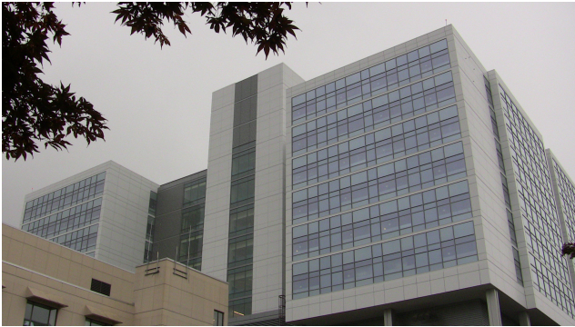
Providence Regional Medical Center

Serving Northwest families for more than 100 years, Providence-Everett hospital has provided exceptional, compassionate care for the community since 1905. Providence-Everett has changed dramatically since its